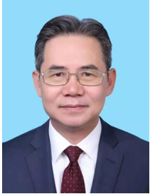
Message from Ambassador